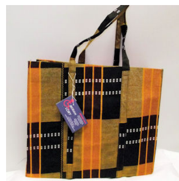
Deddeh Bag $10 donation