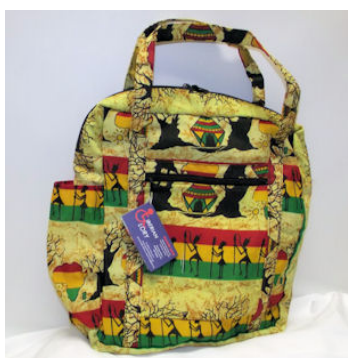
Maude Bag $10 donation