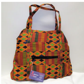
Makula Bag $15 donation