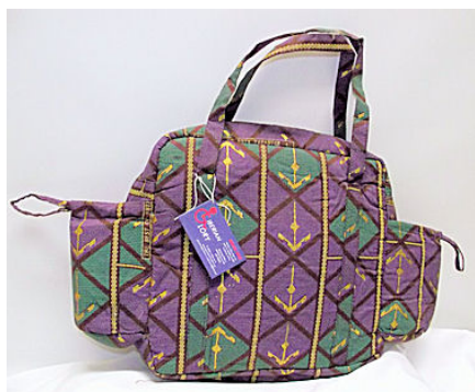
Miata Bag $20 donation